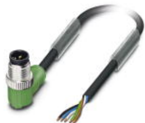
Sensor/actuator cable, 5-position, PUR halogen-free, black-gray RAL 7021, Plug angled M12, A-coded, on free cable end, cable length: 1.5 m

Please be informed that the data shown in this PDF Document is generated from our Online Catalog. Please find the complete data in the user's documentation. Our General Terms of Use for Downloads are valid ( http://phoenixcontact.com/download )